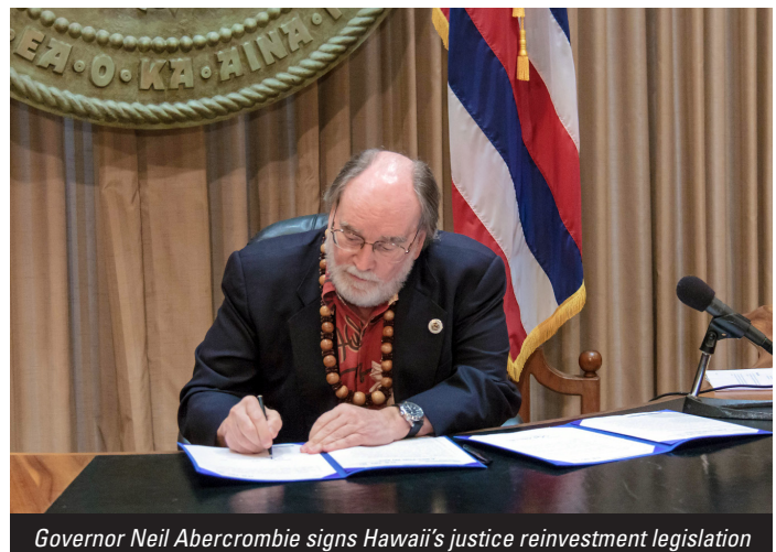
Governor Neil Abercrombie signs Hawaii’s justice reinvestment legislation