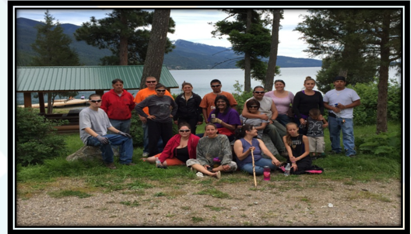
The Flathead Reservation Reentry Program: Public Defender Based Supportive Services Picture from: Blue Bay 2016, Tribal Defenders and clients working together for an annual community service/clean-up event.