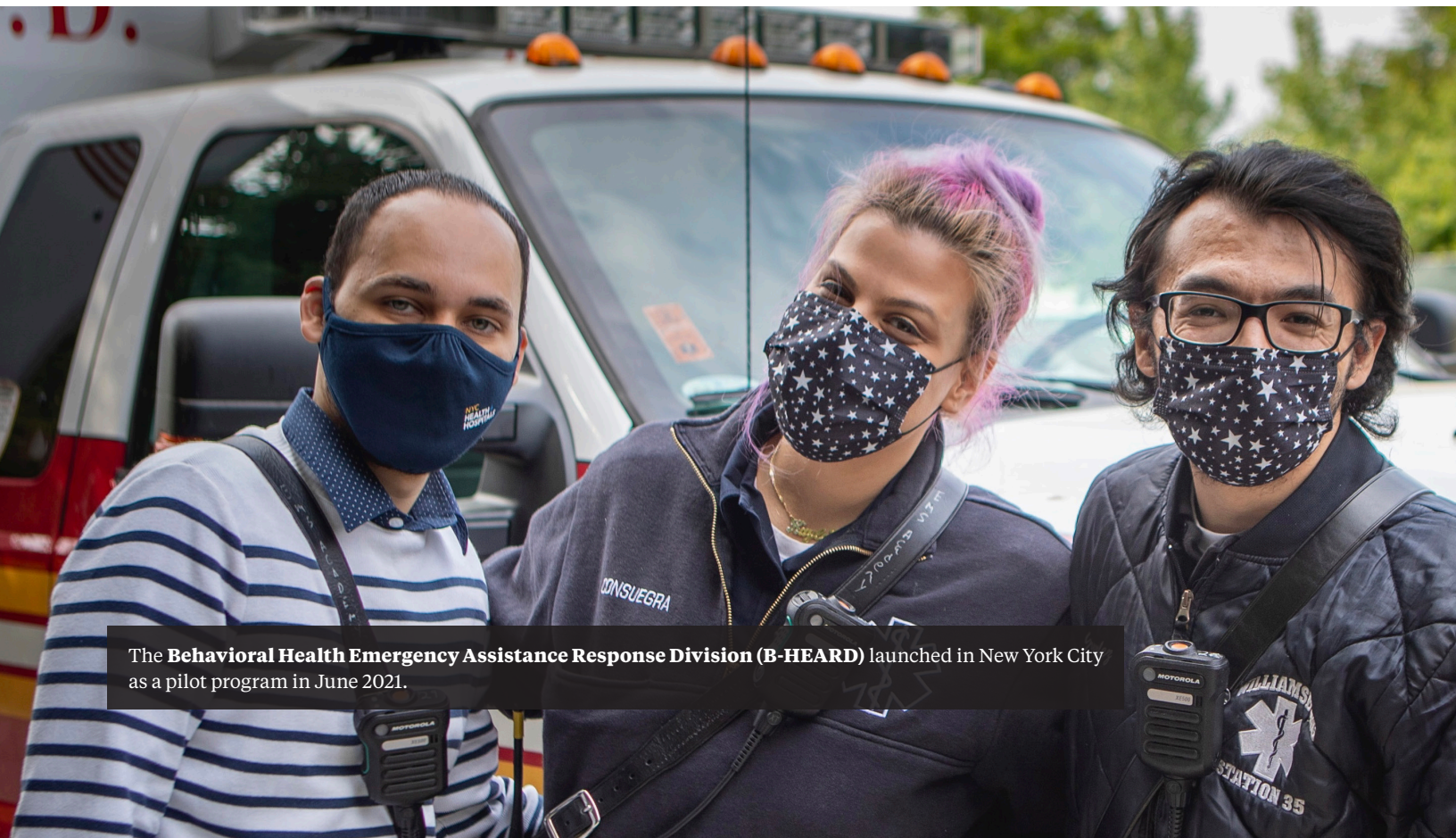
The Behavioral Health Emergency Assistance Response Division (B-HEARD) launched in New York City as a pilot program in June 2021.