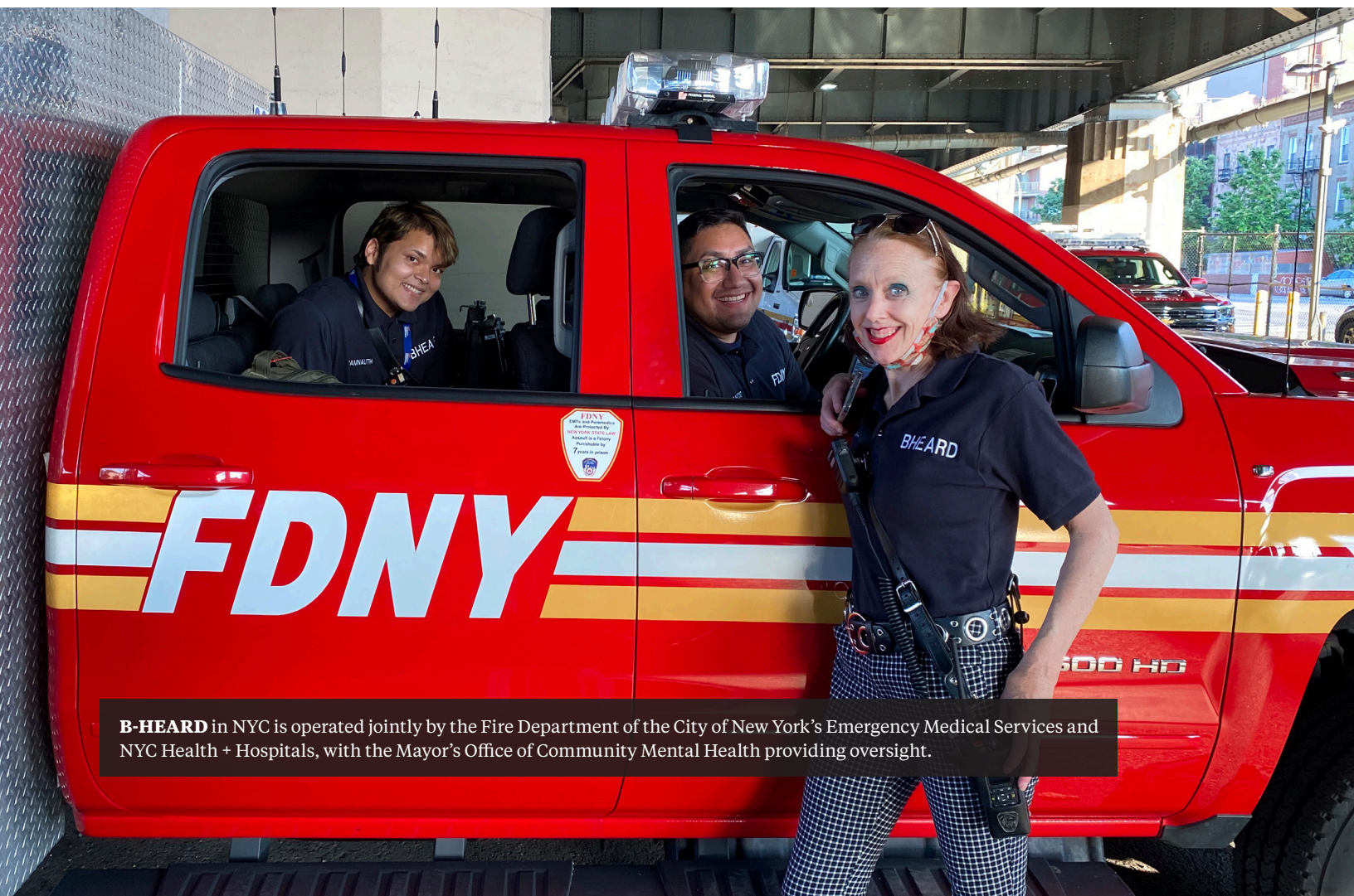
B-HEARD in NYC is operated jointly by the Fire Department of the City of New York’s Emergency Medical Services and NYC Health + Hospitals, with the Mayor’s Office of Community Mental Health providing oversight.