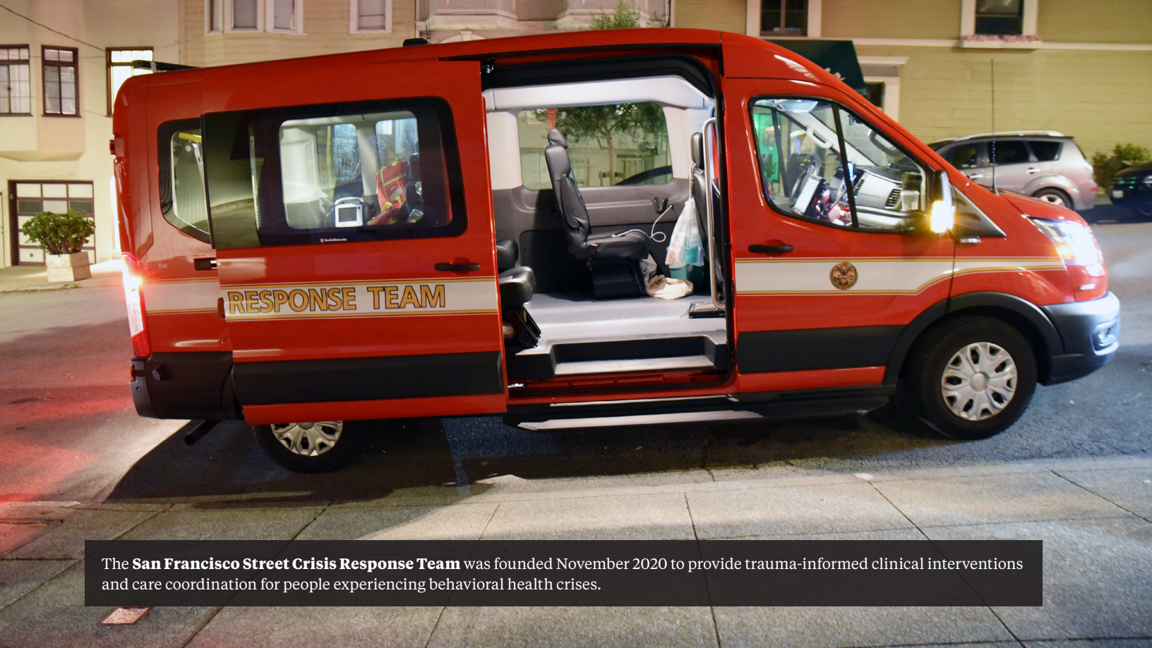
The San Francisco Street Crisis Response Team was founded November 2020 to provide trauma-informed clinical interventions and care coordination for people experiencing behavioral health crises.