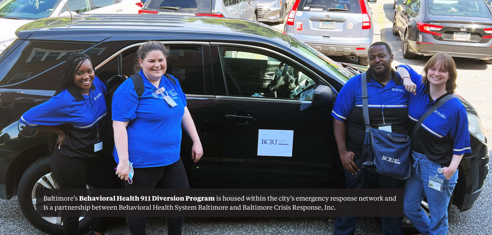
Baltimore's Behavioral Health 911 Diversion Program is housed within the city's emergency response network and is a partnership between Behavioral Health System Baltimore and Baltimore Crisis Response, Inc.

When creating policies and procedures for identifying appropriate calls for community responder programs, 9 commissioners identified multiple factors that should be considered, such as state, regional, and local policies and regulations, liability protections for people answering and dispatching calls, safety (of staff, the person in need, and the surrounding community), capacity of responders, available resources, the wants and needs of the individual, and the wants and needs of the community. With those in mind, community responder program leaders can work with others to develop clear processes to test and improve the quality and consistency of call identification and dispatch.