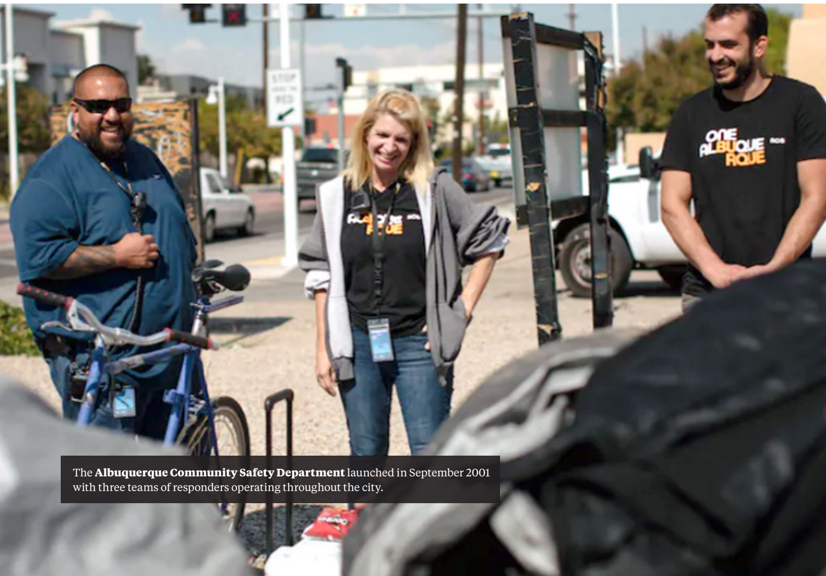
The Albuquerque Community Safety Department launched in September 2001 with three teams of responders operating throughout the city.

CSG Justice Center staff worked closely with the commissioners to identify and share these emerging practices with the field. Staff also documented the process of establishing and facilitating the commission to help communities create a commission of their own (or group of diverse decision-makers) to drive their initiatives. This report first explains the process of establishing the Expanding First Response National Commission and then details the emerging practices that program leaders can use to elevate and replicate community responder programs nationwide.