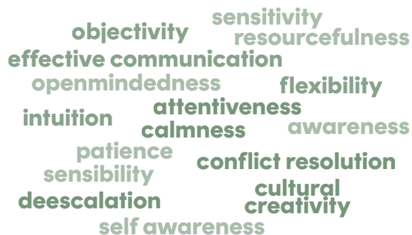
Figure 1: Examples of qualities commissioners identified as particularly important for programs to consider when hiring.

Recruitment and hiring practices and policies can look different across communities, but commissioners identified the qualities in Figure 1 that might ensure the role is the right fit for both the responder and the community. These qualities are typically indicators that responders will be emotionally intelligent, knowledgeable, connected to community resources, and will exemplify good judgment and patience. However, programs can determine which skills and qualities are most important for their community’s needs.