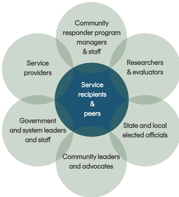
Figure 2: Examples of perspectives to include in decision making.

Each partner’s roles, identities, and experiences will likely overlap, which can increase representation from the community that the program serves. Involving each as early as possible opens programs up to creative approaches and solutions to community and program needs. Also, commissioners noted that in communities where a labor union represents current first response personnel, work cannot simply be taken away from them and given to a different response system. Therefore, programs should include labor unions in program development discussions as early as possible to ensure the program is accepted and supported as an additional resource to an overburdened system rather than a replacement.