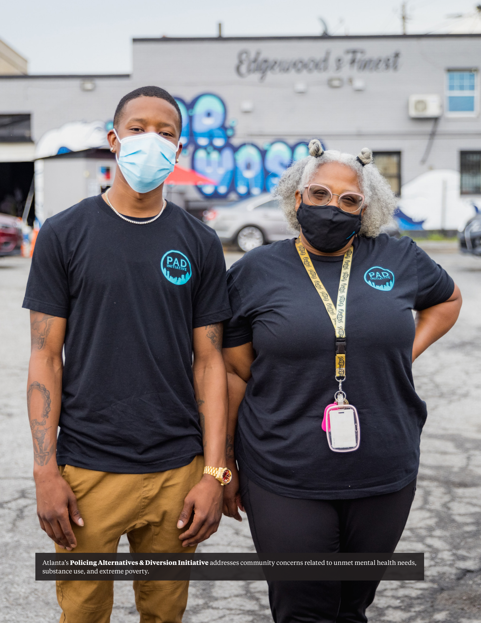
Atlanta's Policing Alternatives & Diversion Initiative addresses community concerns related to unmet mental health needs, substance use, and extreme poverty.