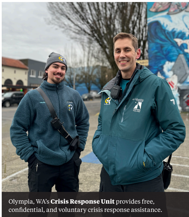
Olympia, WA's Crisis Response Unit provides free, confidential, and voluntary crisis response assistance.

Using consensus building methods, the 21 commissioners identified emerging practices to elevate and expand first response with community responder programs. As commissioners shared their insights, CSG Justice Center staff gathered the information using hand-typed notes, Slido polls, discussions in the Zoom chat, and audio recordings. After each meeting, staff emailed commissioners a SurveyMonkey questionnaire, inviting them to respond with any additional insights on the topic they discussed that month. The staff reviewed these data and coded the responses to identify emerging practices that communities nationwide could use to support their local efforts, and then distributed the findings to the commissioners for feedback. Once finalized, staff used the findings to craft the emerging practices highlighted in this report.